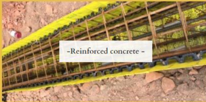
-Reinforced concrete -