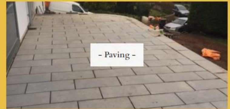
- Paving -